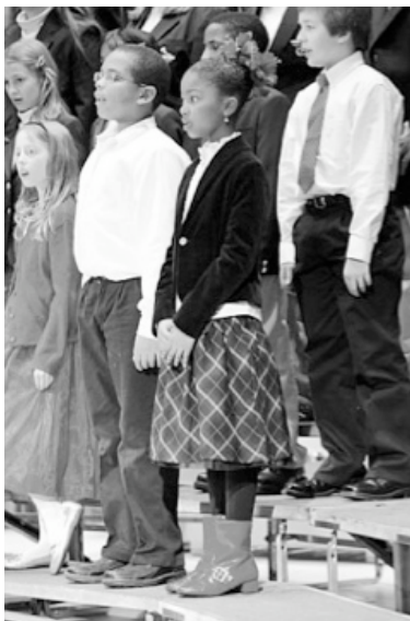
Members of Youth Choir in concert- December 2008

We believe that together, the WCC staff, choristers & families can uphold the mission of an organization that aims to provide positive life-changing experiences for each child.